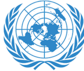
United Nations (UN)